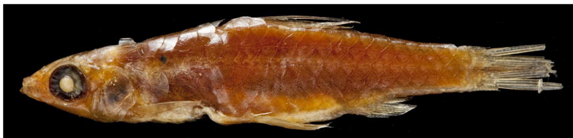
fig. 1. Nannostomus beckfordi , holotype, BMNH 1871.12.28.10, Coast of Demerara, Guyana