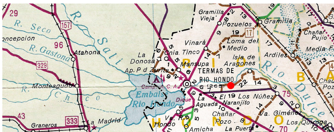
Figure 1. Map showing the localities of the rivers Salí and Seco in Tucuman province (green background west of the dotted line) and of Río Dulce and the town of Termas de río Hondo in Santiago del Estero province. Map shows an area of approximately 115 WE x 45 NS km. Red dot shows the assumed position of the type locality.

In the passage on 'Lebensraum und Fang' (habitat and capture) Knaack informs that single specimens were captured in the lower sections of Seco and Salí rivers, but no preserved specimens from these localities are listed in the paper. Río Dulce is the effluent of the dam lake Embalse Río Hondo, which here forms the political border between the provinces Tucuman and Santiago del Estero. Río Salí is one of the affluents of the lake and Río Seco is a tributary of Río Salí (figure 1). As the basin of Río Salí is restricted to the territory of the province of Tucuman, a locality from this river located in the province Santiago del Estero, as given with the collection data of the holotype, does not exist. Following the only precise and conclusive data provided in the section Locus typicus and the impossibility of the data given with the holotype, the Río Dulce some 20 km downstream from Termas de Río Hondo has to be considered to be the type locality. The approximate location is shown in figure 1 as red dot. As Knaack does not provide a map or GPS data about the type locality the approximate position is tentatively localized by combined usage of a paper map (ACA) and Google Earth (2007, v.