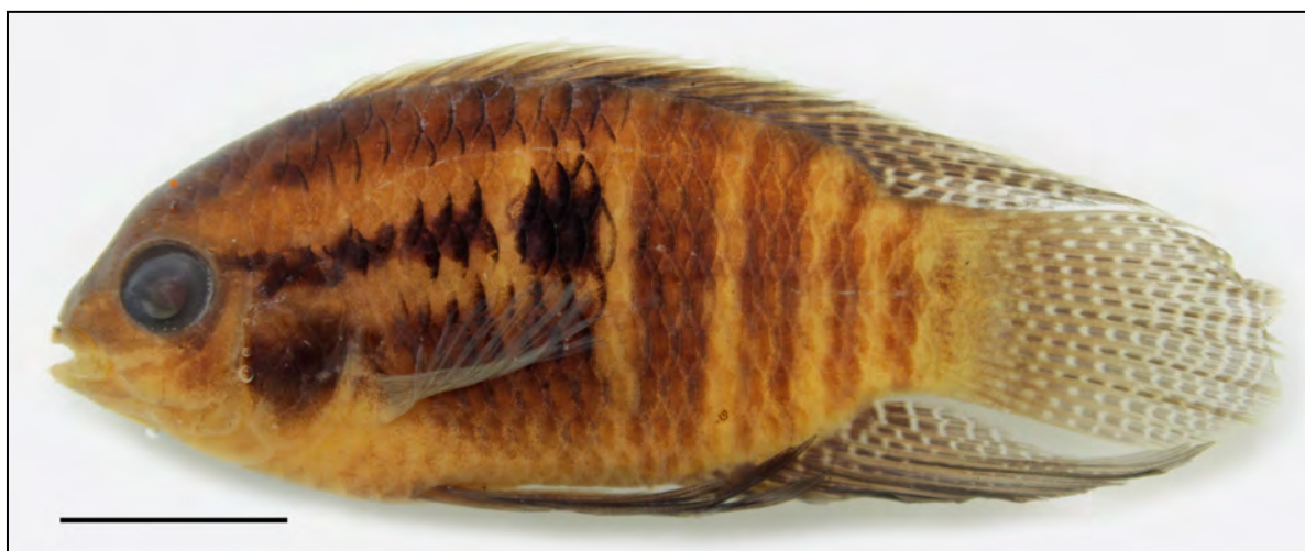
fig. 7. Laetacara dorsigera . MNHNP 3411. Paraguay, Departamento de Itapúa, Estancia Santa Teresa, charco aprox. a 30 mt del casco de la estancia, San Pedro del Paraná

Morphology. Body moderately elongated, compressed. Head large; snout short, rounded tip; eye large; first gill arch with short rakers, upper limb without fleshy lobe. Dorsal profile of body from snout tip to end of dorsal-fin insertion convex; ventral profile of body convex; nearly straight between pelvic fin and anal fin; straight dorsally and ventrally on final portion of caudal peduncle. Dorsal fin long, posterior portion distal margin almost reaching caudal fin margin; pectoral fin short; pelvic fin long, reaching middle of anal-fin insertion; anal fin long, posterior portion distal margin almost reaching caudal fin margin, anal-fin base medium; caudal fin short, rounded. Head scales cycloid, body scales ctenoid.