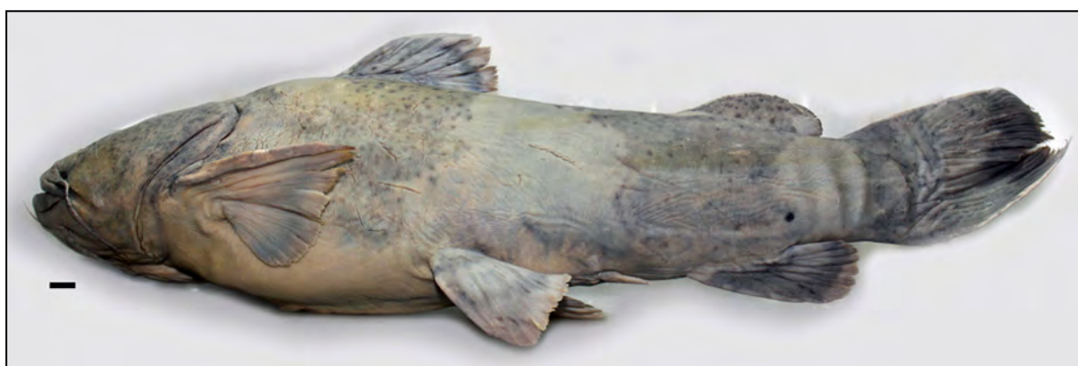
fig. 5. Pseudopimelodus mangurus . MNHNP 3978. Paraguay, Departamento de Itapúa, Río Paraná en el Club de Caza y Pesca Bella Vista, Bella Vista

Examined material. All from Paraguay: Departamento de Itapúa : MNHNP 3978, alc. 2., 267.0-229.5 mm SL, Río Paraná en el Club de Caza y Pesca Bella Vista, Bella Vista. MNHNP 3979, alc. 1, 310.0 mm SL, Río Paraná en el Club de Caza y Pesca Capitán Meza, Capitán Meza.