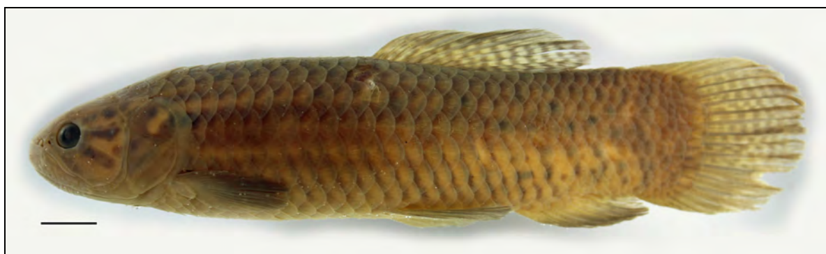
fig. 1. Erythrinus erythrinus . MNHNP 239. Paraguay, Departamento de Presidente Hayes, Estancia La Golondrina, lugar pantanoso aprox. a 25 km al noroeste por el Río Confuso

Examined material. All from Paraguay: Departamento de Presidente Hayes : MNHNP 239, alc. 7, 65.9-126.3 mm SL, Estancia La Golondrina, lugar pantanoso aprox. a 25 km al noroeste por el Río Confuso.