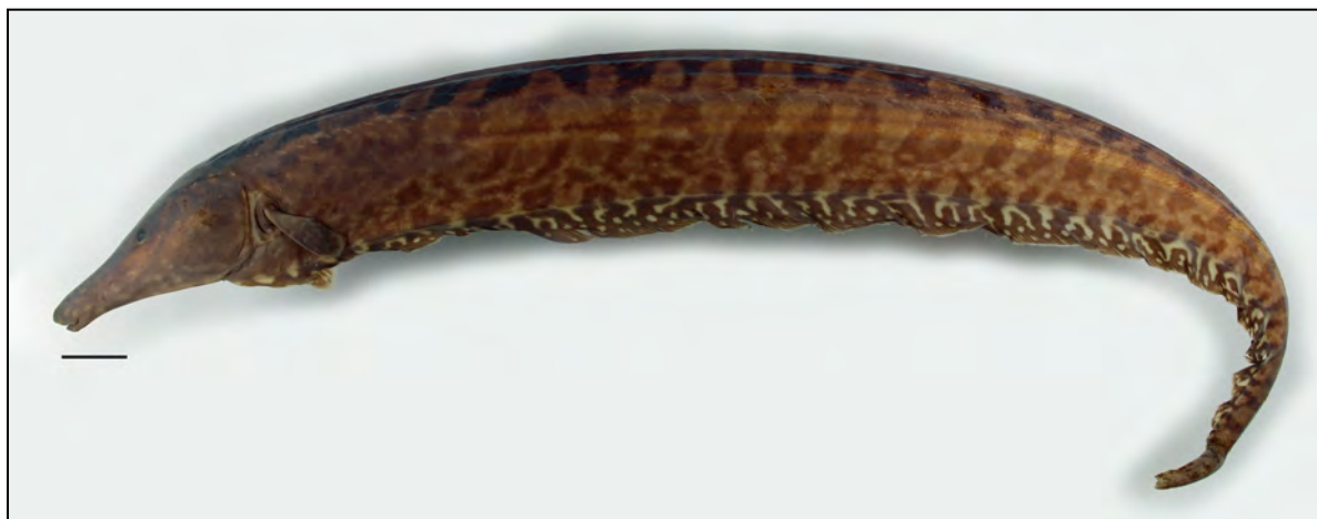
fig. 6. Rhamphichthys hahni . MNHNP 2299. Paraguay, Departamento de Alto Paraguay, Río Negro, aprox. 2 km aguas arriba de la desembocadura