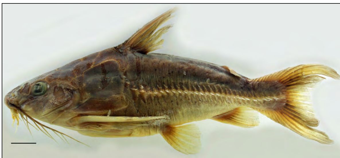
fig. 4. Ossancora punctata . MNHNP 2787. Paraguay, Departamento de Cordillera, Lago Ypacaraí en el Club Náutico San Bernardino, San Bernardino

Examined material. All from Paraguay: Departamento de Cordillera : MNHNP 2787, alc. 2, 121.3-123.3 mm SL, Lago Ypacaraí en el Club Náutico San Bernardino, San Bernardino.