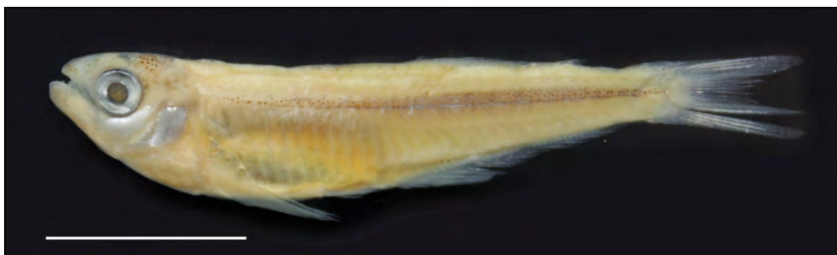
fig. 3. Clupeacharax anchoveoides . CZCEN 396. Paraguay, Departamento de Presidente Hayes, Riacho Paloma

Examined material. All from Paraguay: Departamento de Presidente Hayes : CZCEN 396, alc. 5, 25.7-32.9 mm SL, Riacho Paloma. CZCEN 397, alc. 1, 36.7 mm SL, Rio Negro, Nanawa.