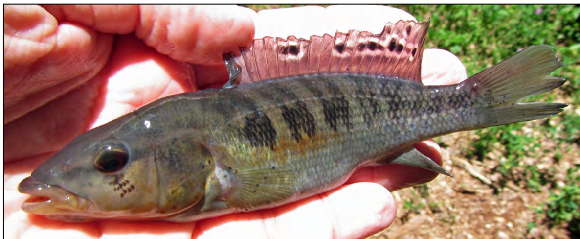
fig. 1. Adult female of Crenicichla yaha (MLP 11215) in breeding coloration. Arroyo Falso Uruguay-i. Note lack of spotting on body distinguishing C. yaha from C. tesay . Note orange coloration on flank also distinguishing C. yaha from C. tesay , but similar to sympatric C. ypo and all related species in the Middle Paraná. Note black elongated spot in dorsal fin with white margin as in all related species in the Paraná/Iguazu (including C. tesay ) except the sympatric C. ypo (where there is a orange band in ventral portion of the dorsal fin and a black band above it without a white margin). This character difference in the dorsal fin from the sympatric C. ypo suggests sexual selection and species recognition.

tesay (usually whole more greyish) and 6) slightly less scales in E1 row. Distinguished from the other molluscivorous species C. taikyra by points 4 and 5 (point 2, breeding coloration of females, is not known in C. taikyra ), by having a distinctly more robust head and body (both almost without overlap) and by having distinctly less scales in E1 row (also without overlap). Distinguished from all other species in the C. mandelburgeri group by the molluscivorous-associated characters (robust LPJ, robust LPJ teeth, robust head with short jaws and hypognathous mouth). Distinguished from all species in the C. missioneira group (that also include molluscivorous species) by well developed suborbital stripe (vs. very weakly developed and diffuse, composed of a few isolated spots at best).