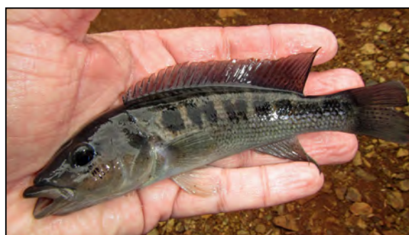
fig. 5. Adult male of C. yaha (MLP uncatalogued) from the arroyo Urugua-í. Note spotted dorsal fin distinguishing males from females.

Distribution and ecology. Crenicichla yaha is endemic to the Urugua-í basin above the original 28 m high waterfall, i.e. above the present dam. It does not however occur in the artificial lake which has everywhere a muddy bottom but is apparently only found in the middle stretches of the main stream and its main tributary (arroyo Falso Urugua-í; figure 6) in areas with bottoms made of stones, boulders and solid rock. Here C. yaha is syntopic with the much more common C. ypo and in rare cases with the undescribed predatory C. sp. Urugua-í line which is common only in the artificial lake. Crenicichla yaha is apparently not present in the upper parts of the main river and the larger tributaries (Falso Urugua-í, Uruzu) and also not in the small tributaries where in all cases only C. ypo is present or where cichlids are absent (headwaters of small tributaries).