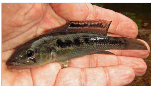
fig. 4. Young female of C. yaha (MLP 11217) from arroyo Urugua-í. Note black elongated spot in dorsal fin.