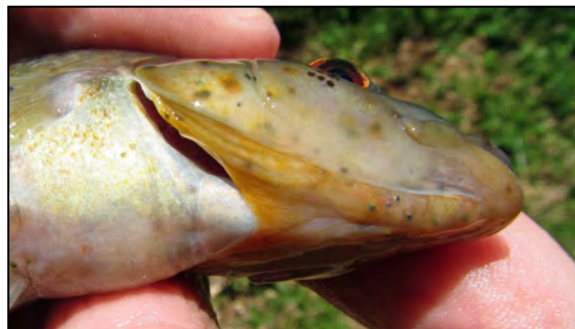
fig. 3. Detail of lower portion of head of the same female of C. yaha showing orange branchiostegal membrane distinguishing C. yaha from C. tesay and the sympatric C. ypo (where in both cases grey).