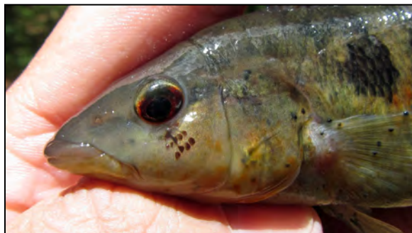
fig. 2. Detail of head of the same female of C. yaha . Note sub-terminal hypognathous mouth similar to C. tesay but different from the prognathous mouth of the sympatric C. ypo .