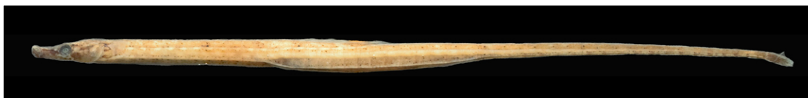
fig. 1. Preserved specimen of P. brasiliensis : CICCAA 00164, 81.5 mm SL. Tutóia municipality, Barro Duro River basin, Maranhão state, Northeastern Brazil.

Barro Duro River system, other estuarine fish species could also be found: Dormitator maculatus (Bloch 1792) and Eleotris pisonis (Gmelin 1789) (see co-faunal material).