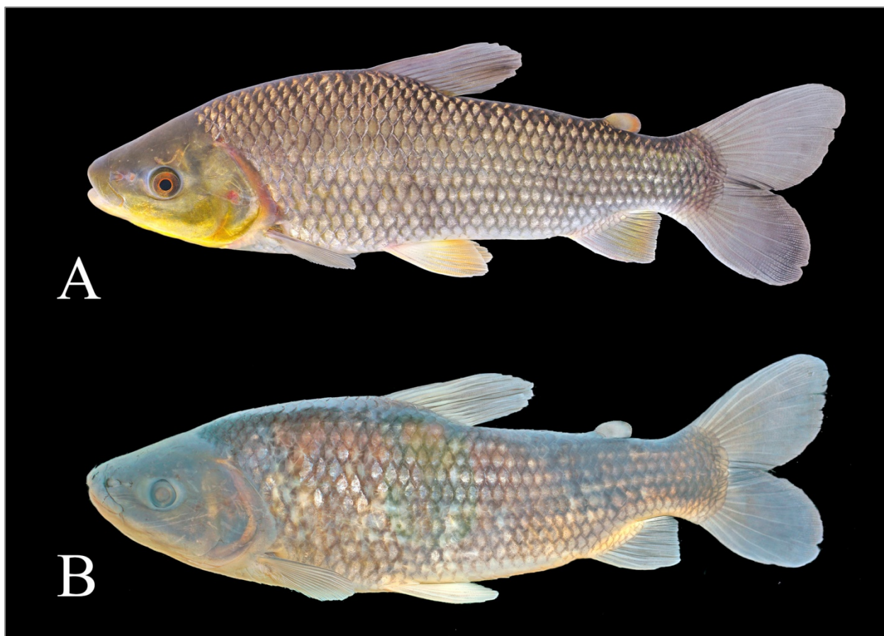
fig. 1 Megaleporinus macrocephalus , MLP-Ict 11935, 1, 191,3 mm SL. A. Coloration in life (right side, horizontally flipped). B. Coloration in alcohol (left side).

A fish specimen recently collected from the Río Santiago, in the Río de la Plata basin near Ensenada, Buenos Aires, was examined taxonomically. Upon comparison with anostomid species known to occur in the Río de la Plata basin, the specimen was identified as M. macrocephalus . The aim of this contribution is to report the presence of this species in the Río Santiago, within the Río de la Plata basin, based on morphological data. This finding represents the southernmost known record of the species to date and appears to be part of an ongoing process of geographical expansion, likely associated with its artificial introduction into the basin.